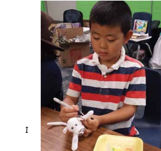
Day Camp Full Day & Day Camp Fun Block Schedule