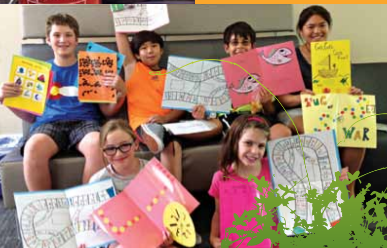
make a game