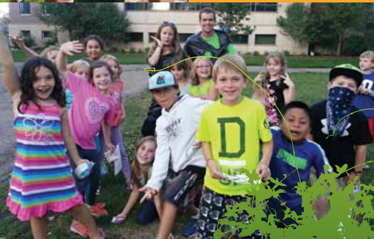
trash bag prom